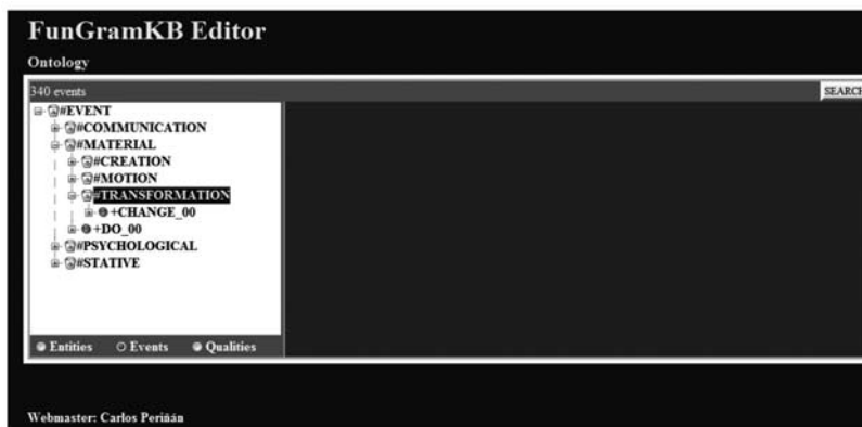
FIGURE 2 The metaconcept #TRANSFORMATION in FunGramKB