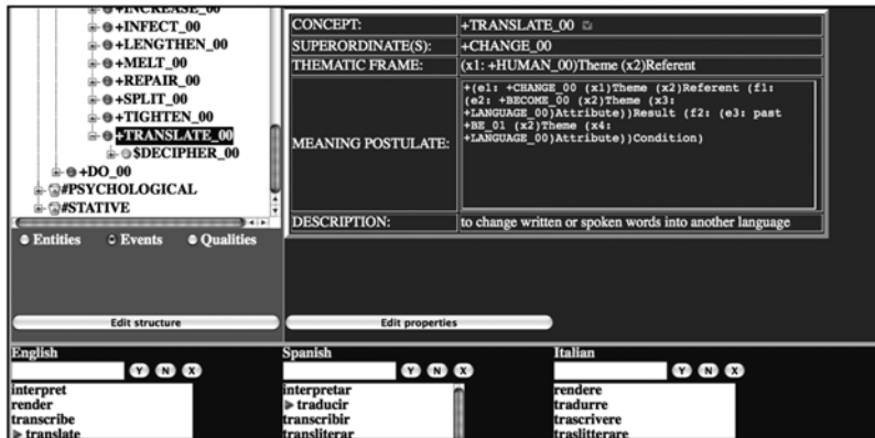
FIGURE 3 Conceptual information of the basic concept +TRANSLATE_00

MP = *(e1: +TRANSLATE_00 (x1)Theme (x2)Referent (f1: (e2: n +UNDERSTAND_00 (x3: +HUMAN_00)Theme (x2)Referent))Purpose)